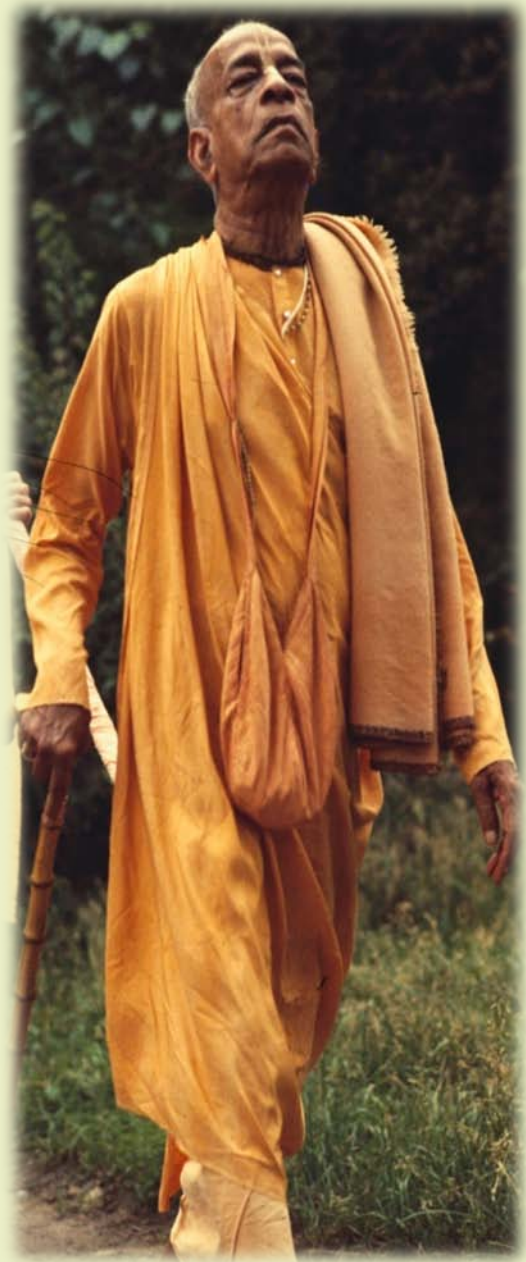
Srila A.C. Bhaktivedanta Swami Prabhupada

“As we moved along the park’s winding path, Prabhupada took each step decisively, first testing the ground with his cane to insure that the footing was solid. Some of the snow had melted, forming puddles of water, but the freezing temperatures of nighttime had created a thin coating of ice over the water. Each time we came to a puddle of ice, Prabhupada would stop and, gripping his cane firmly, smash it down upon the ice. It was something that a child would have done, and yet Prabhupada’s expression remained grave. After he repeated this for a fourth time, I inquired what the purpose behind it was. Prabhupada looked from the broken pieces of ice to explain, “This ice is maya. The natural state of water is liquidity. Now it has become hard. And just as we have to apply heat to melt the ice, similarly, by applying the mahamantra , the hard hearts of the materialists will melt.” And Prabhupada walked on, smashing each puddle, breaking maya’s back. To break each and every frozen puddle was an expression of Prabhupada’s firm determination not to allow maya’s icy grip a single foothold...In the distance we saw an old man giving dried crumbs of bread to a flock of birds. Prabhupada remarked that just like with this old man, it is a natural propensity of everyone to render service to someone or something. But only by directing our service to Krsna can we actually become happy.”